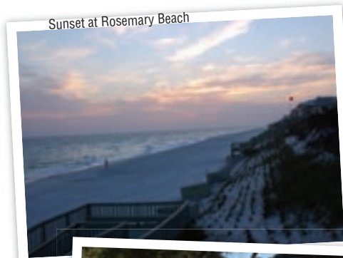
Sunset at Rosemary Beach