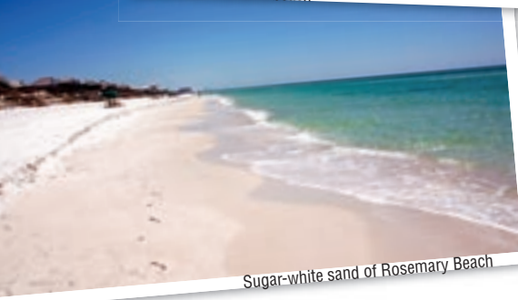
Sugar-white sand of Rosemary Beach

Rosemary Beach, a perfect example of new urbanism. As soon as I settled into my elegant Carriage House rental unit, I felt like a part of the community and appreciated the thoughtful planning that went into mak-